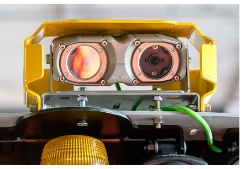
The Blaxtair reversing safety system from Arcure comprises a 3D sensor head, a calculator unit and a screen in the forklift driver's cab.

The size and shape of the risk zone is specifically tailored to the type of forklift and the on-site safety requirements. The necessary settings can be configured during the commissioning by STILL using a simple user interface. No further settings are generally required.