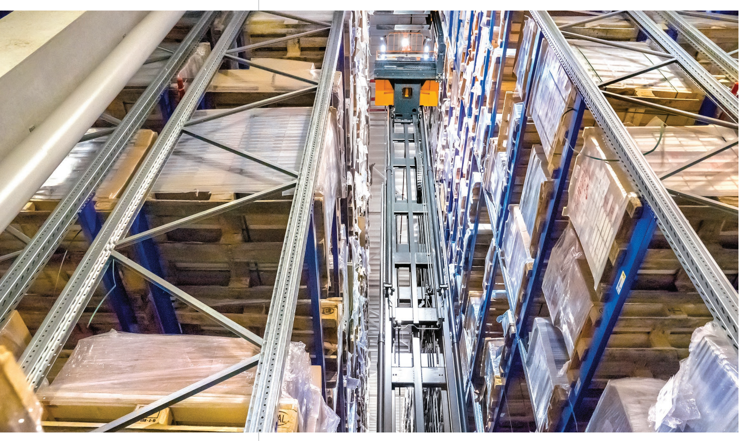
The STILL on-board computer compensates mast deflections effectively, saving time for storage and retrieval.

The mechanism of the turret head was redesigned and made more compact with the help of the new hydraulic drive. The side shift is smoother and the stability of the lift as a whole has been increased. This makes the MX-X a much more stable and silent truck in the narrow aisles. And the chain to swivel the fork has been made redundant. This saves service costs.