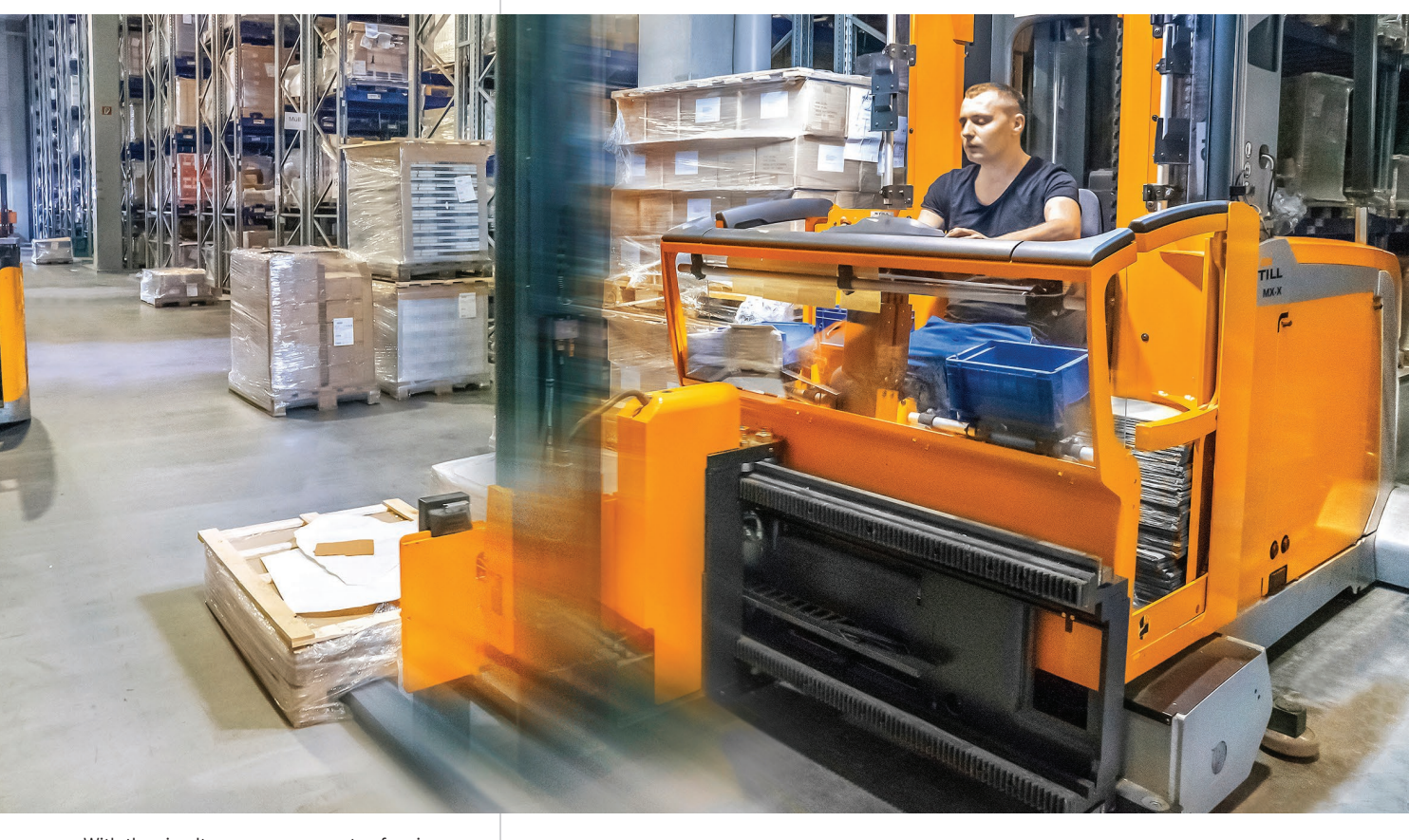
With the simultaneous movements of main and auxiliary lift, the new STILL MX-X makes access to the rack fast.

Every week, up to 20,000 shipments are delivered. With the growth of online-business, batch sizes shrink from pallet size to smaller and smaller lots that are picked from pallets. The new MX-X reacts to this development with an optimised cabin for better ergonomics. The compact redesign of the turret head was not only improved in terms of stability of the auxiliary lift, but also the distance between the cabin and the pallet was reduced by 40 millimetres. Also, the depth of the cabin was increased